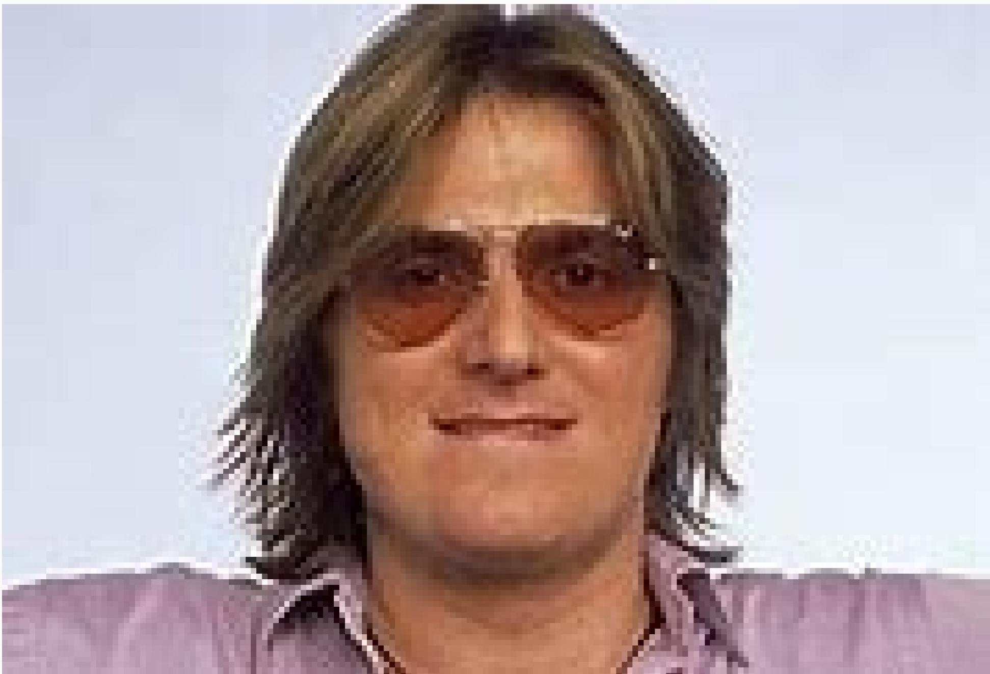
Comedian mitch hedberg cause of death.